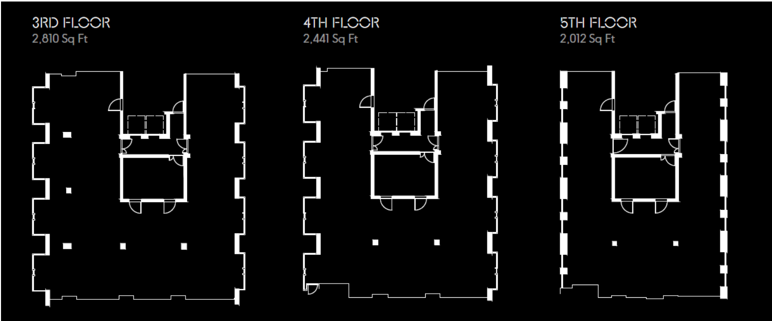
Indicative floor plans from brochure

Floor Plans - Click here for a virtual tour