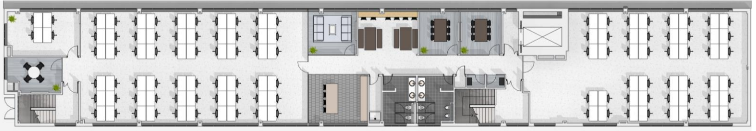
2 nd floor showing two suites of 60 and 40 workstations respectively