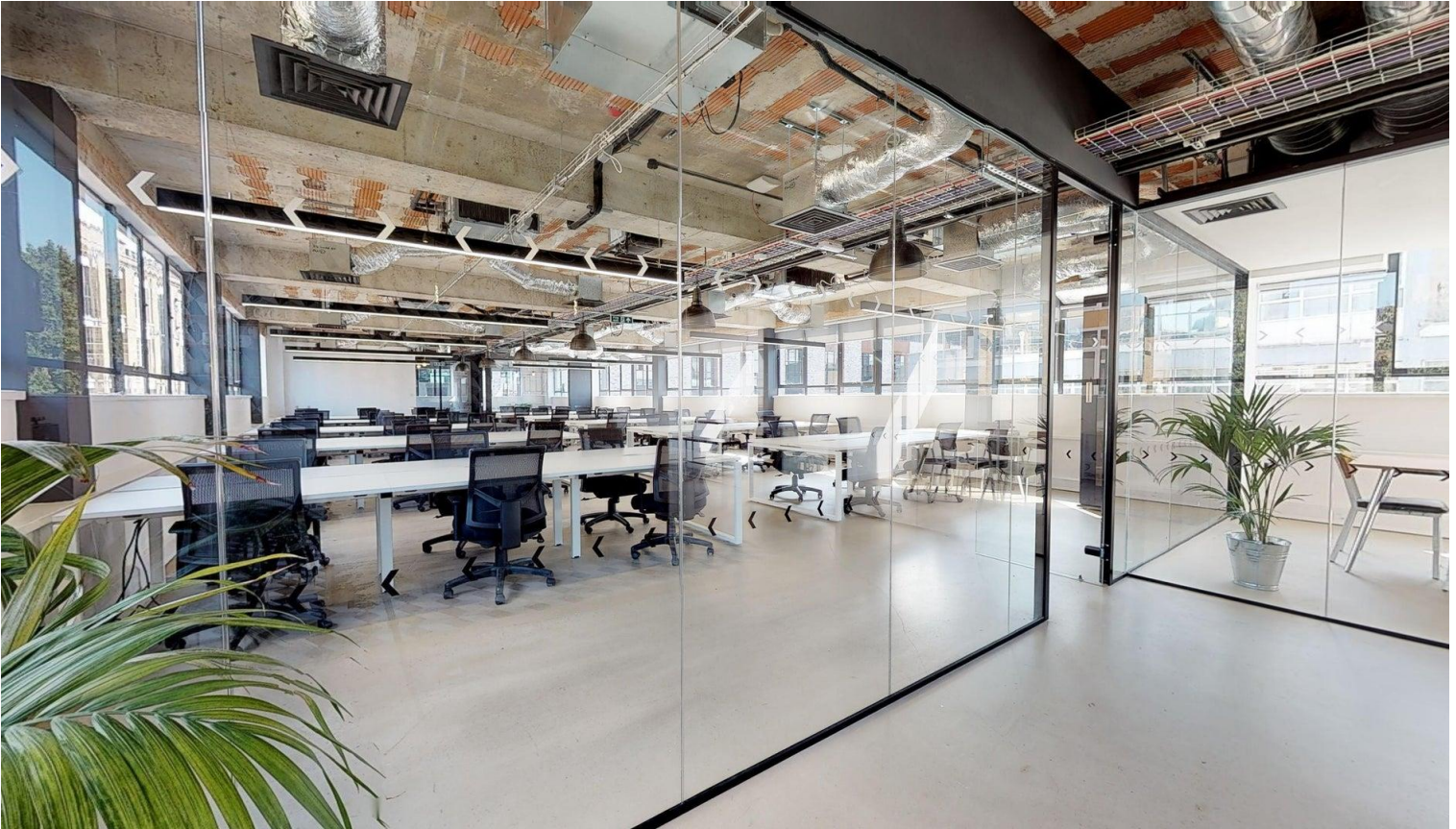
Ground floor layout showing event space and additional smaller suites